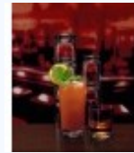
TABLE & SERVINGWARE